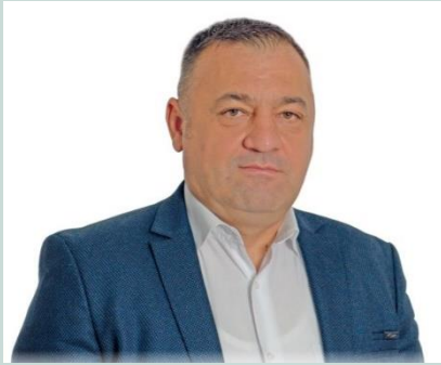
VLADISLAV COCIU Mayor of Ștefan Vodă city